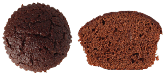
Standard baking powder (SBP) – full cocoa powder