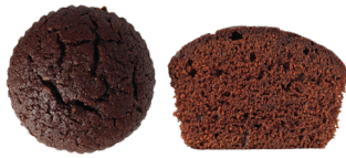
ZEUS™ C120 – full cocoa powder